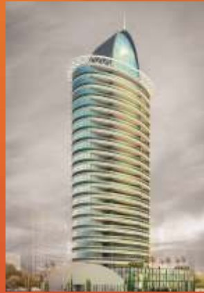
SEA PALACE Palm Beach Road, Nerul